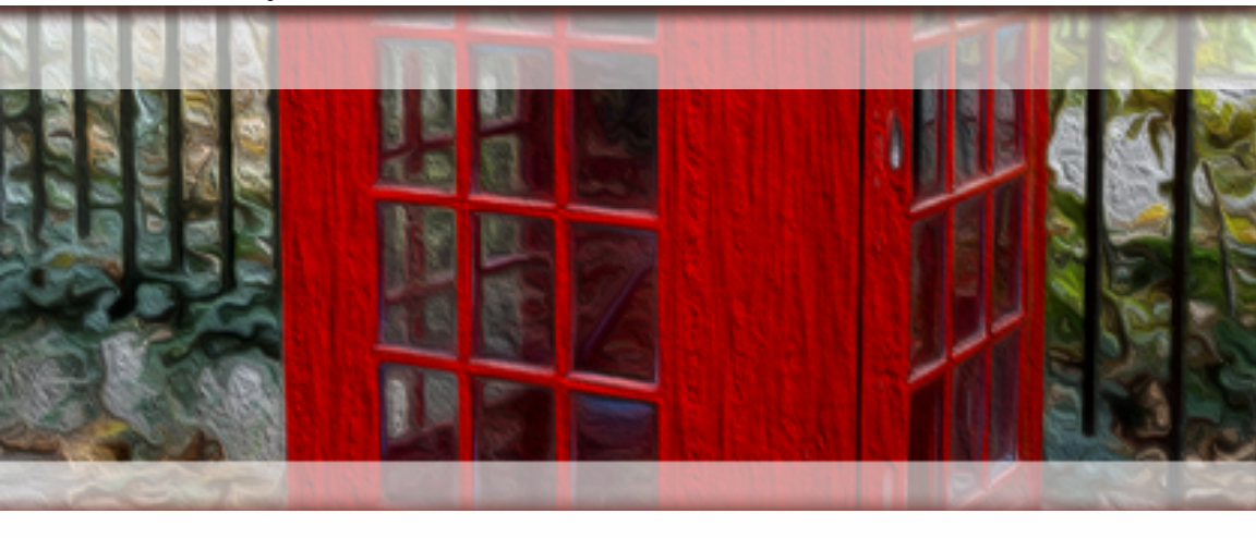
Compiled by Bonnie Follett