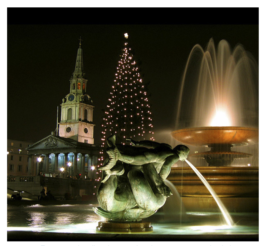
For a complete list of current London-area events, check the London Event Guide.

The sales beginning the day after Christmas are not to be missed. Bargains galore are big in the West End and all over London. Call (020) 7234-5800.